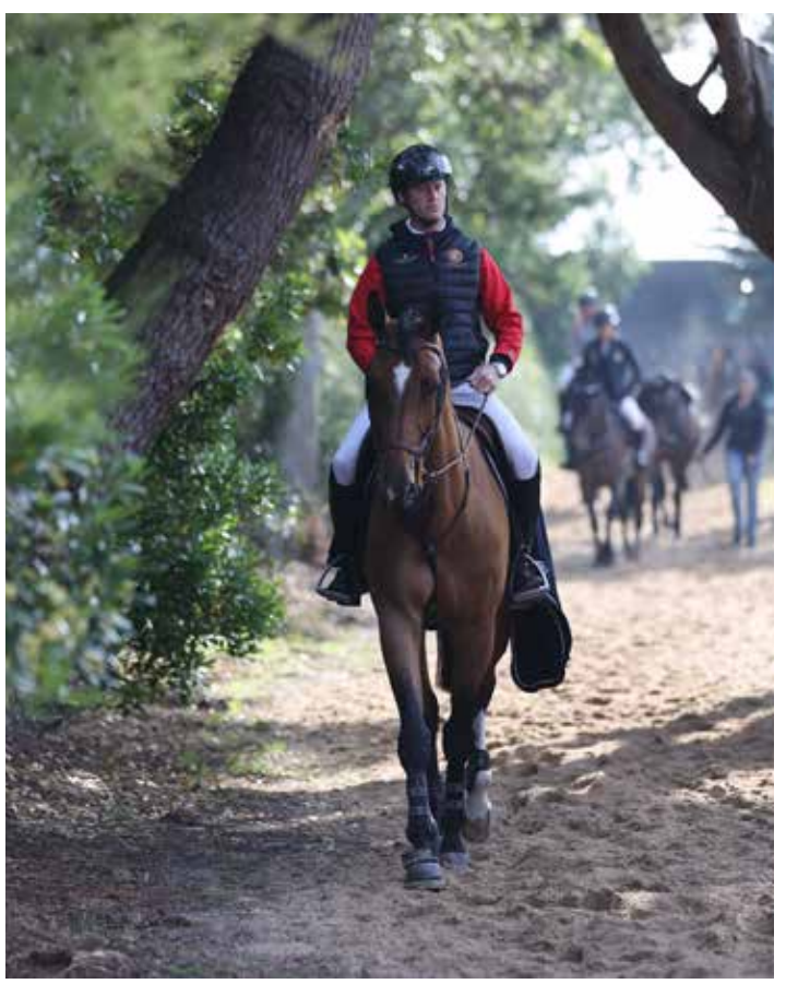
This why we love coming to La Baule.

And let's not forget the crowds! Our riders often talk about the wonderful atmosphere at the competition and we are also very sensitive to it. When we hear all the encouragements, it pushes us to give the very best of ourselves.