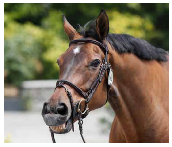
It is obviously no coincidence that the competition has received the equestrian sector EquuRES label environmental and animal wellbeing certification!

In the morning, even the horses that find it difficult to wake and sometimes stay at the back of their box stall do not hang around, because in La Baule, and only in La Baule, we have the right to a little outing on the beach, which is privatised so that we do not risk coming into contact with other horses outside the competition, chiefly to avoid any possible contamination. All bio-safety health rules are strictly observed. We only need to trot for several metres and then it is great to be on the beach with our fellow horses just after sunrise. What a joy it is, not just for the gentle massage of our legs and tendons by the Atlantic Ocean's waves but also for our mental wellbeing. It gives us so much energy before getting to grips with the events.