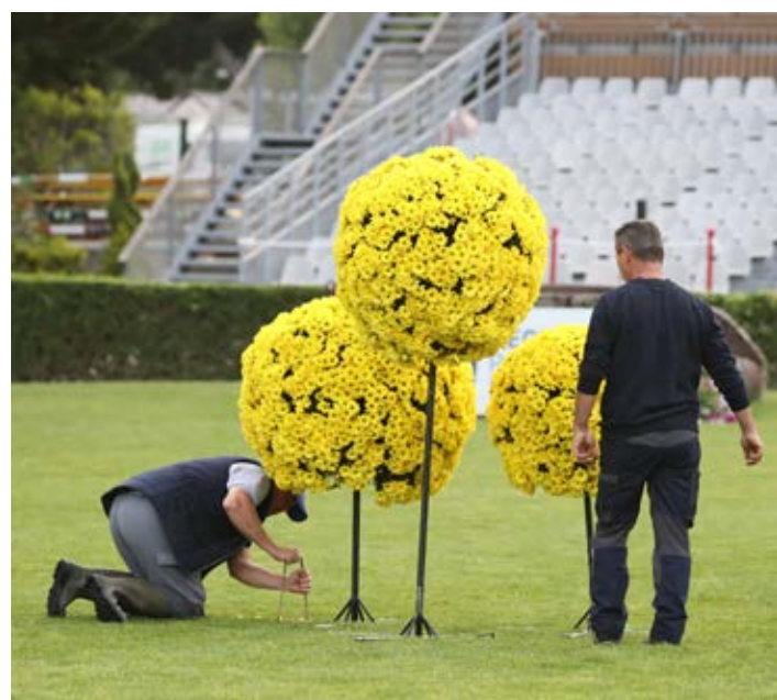
Green space technicians decorate the track at the François André stadium